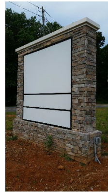
Sample Free Standing Signs