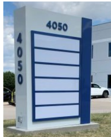
Sample Campus / Shopping Center Sign