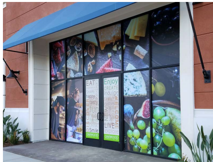
Sample Window Sign

Signs shall be allowed on the inside or outside of window glass of non-residential properties provided that they cover no more than thirty-three percent (33%) of the gross glass area on any one side of the buildings and are not separately illuminated.