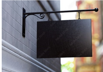
Sample Projecting Sign