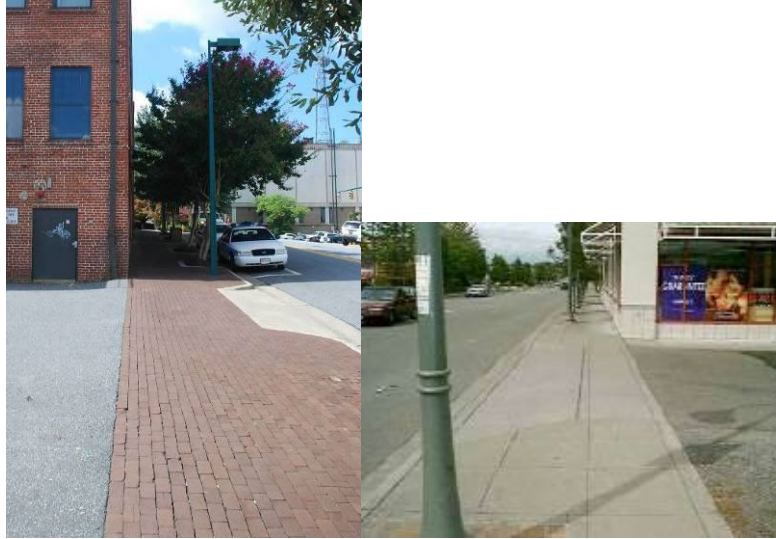
Figure 3-4: Sidewalk Setback from Driveway with Continuous Sidewalk Pattern