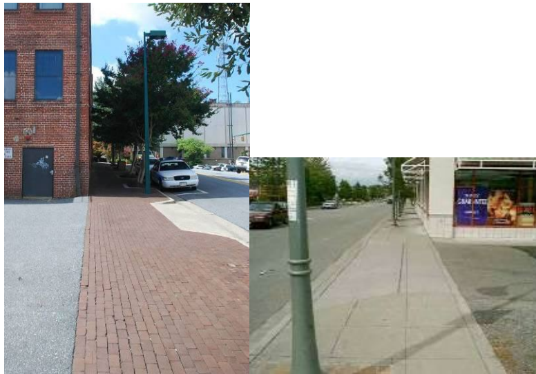
Figure 3-1: Sidewalk Setback from Driveway with Continuous Sidewalk Pattern