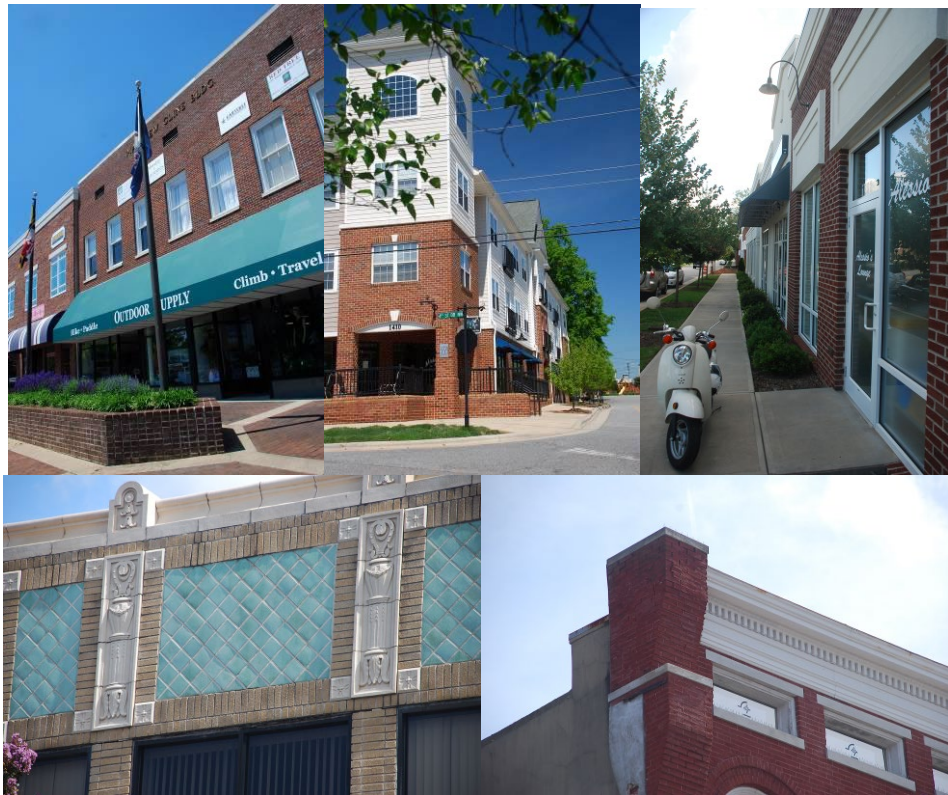
Figure 3-5: Treatment of Blank Walls