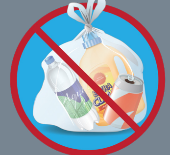
No bagged recyclables