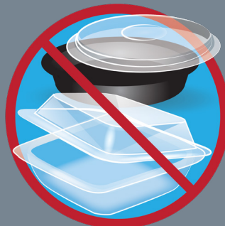
No to-go trays or clamshells