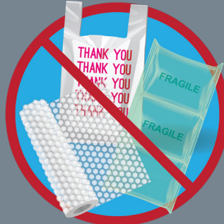
No plastic wrap, pillows or bags