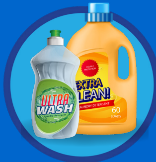
Dish soap and laundry detergent bottles

The following items are commonly overlooked when it comes to recycling at home. Get cart smart — put them in your recycling bin!