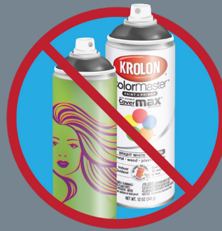
No aerosol cans

Everyone knows bottles and cans go in the recycling bin, but the following items are often mistaken as curbside recyclables. When in doubt, throw it out!