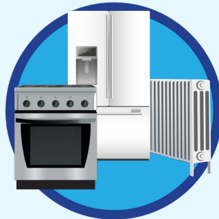
Appliances: Take appliances to a convenience center.