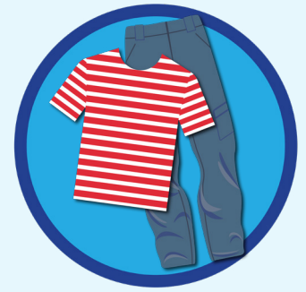
Clothing: Bring clothing and textiles to a convenience center or thrift store.