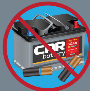
No household or car batteries