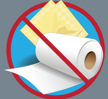
No paper towels or napkins