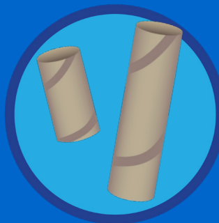
Paper towel/ toilet paper rolls