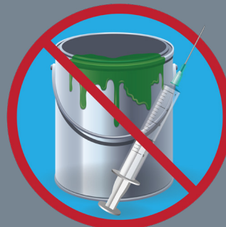
No hazardous or medical waste