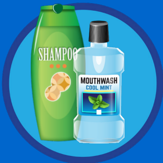
Personal care bottles