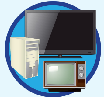
Electronics: Take computers, televisions and other electronics to a convenience center.