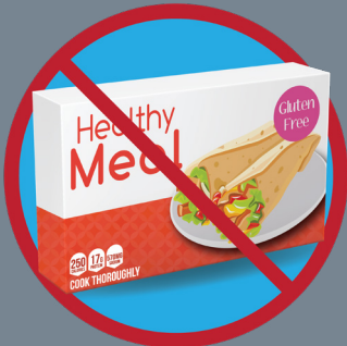
No frozen food boxes