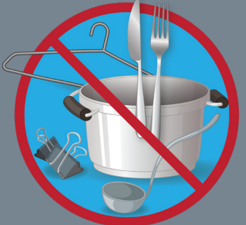
No scrap metal