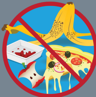
No food waste