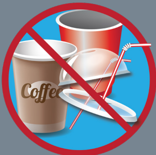
No straws, to-go cups, solo cups or lids