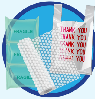
Plastic bags and wrap: Return clean, dry plastic bags, wraps and packaging to your local retailer.

While these items are NOT accepted in your curbside recycling, there are alternative ways to keep them out of the landfill. Call your local recycling convenience center to find out if they accept these items and more!