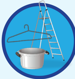
Scrap metal: Take scrap metal and wire to a convenience center.