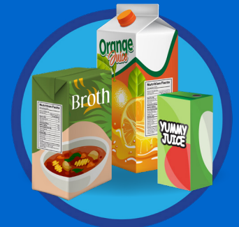
Food and beverage cartons