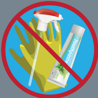
No pumps, tubes or gloves