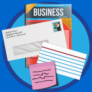
Envelopes, Post-its, index cards and magazines