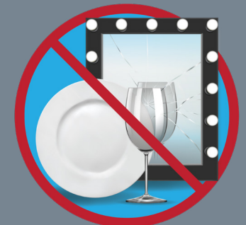
No household glass, mirrors or ceramics