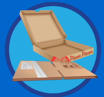
Clean pizza boxes and flattened cardboard boxes