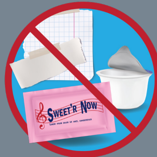
No small/shredded paper, creamers, sweetener packets, etc.