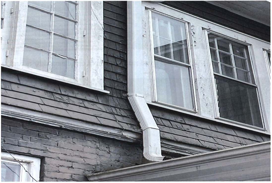
Figure 6: Applicant photo showing current gutters on the house.