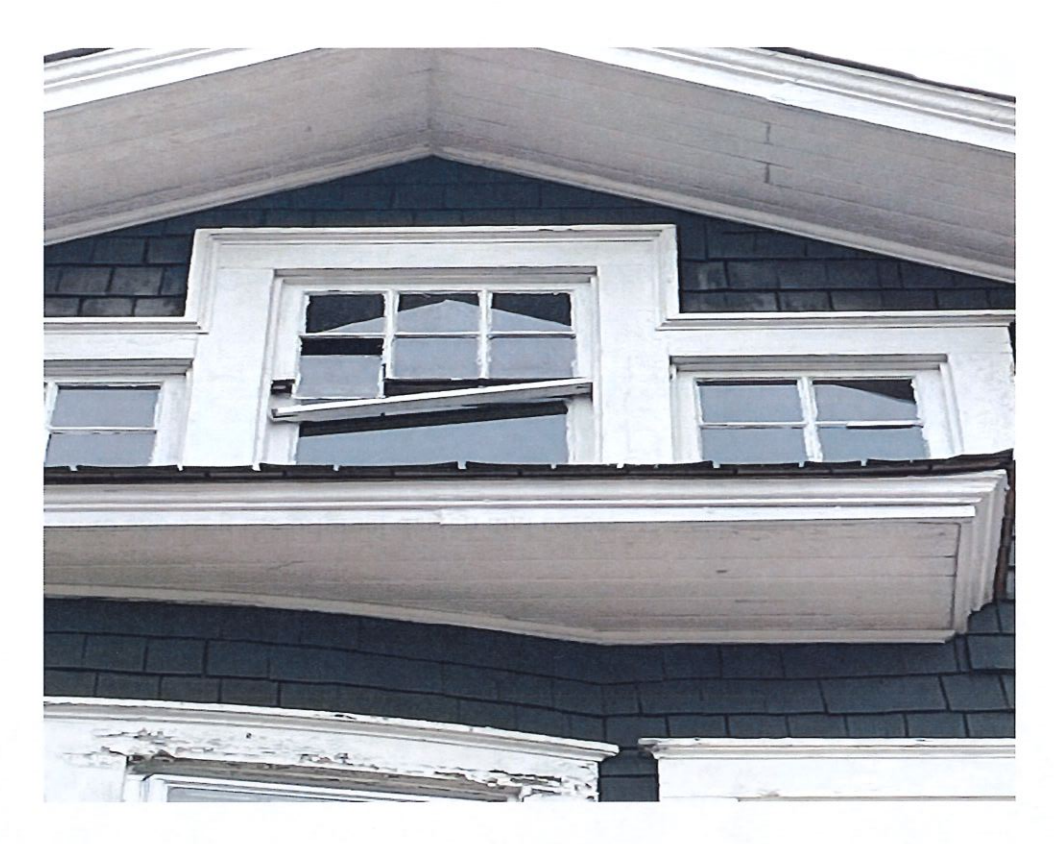
Figure 2: Applicant photo showing the side windows on the house.