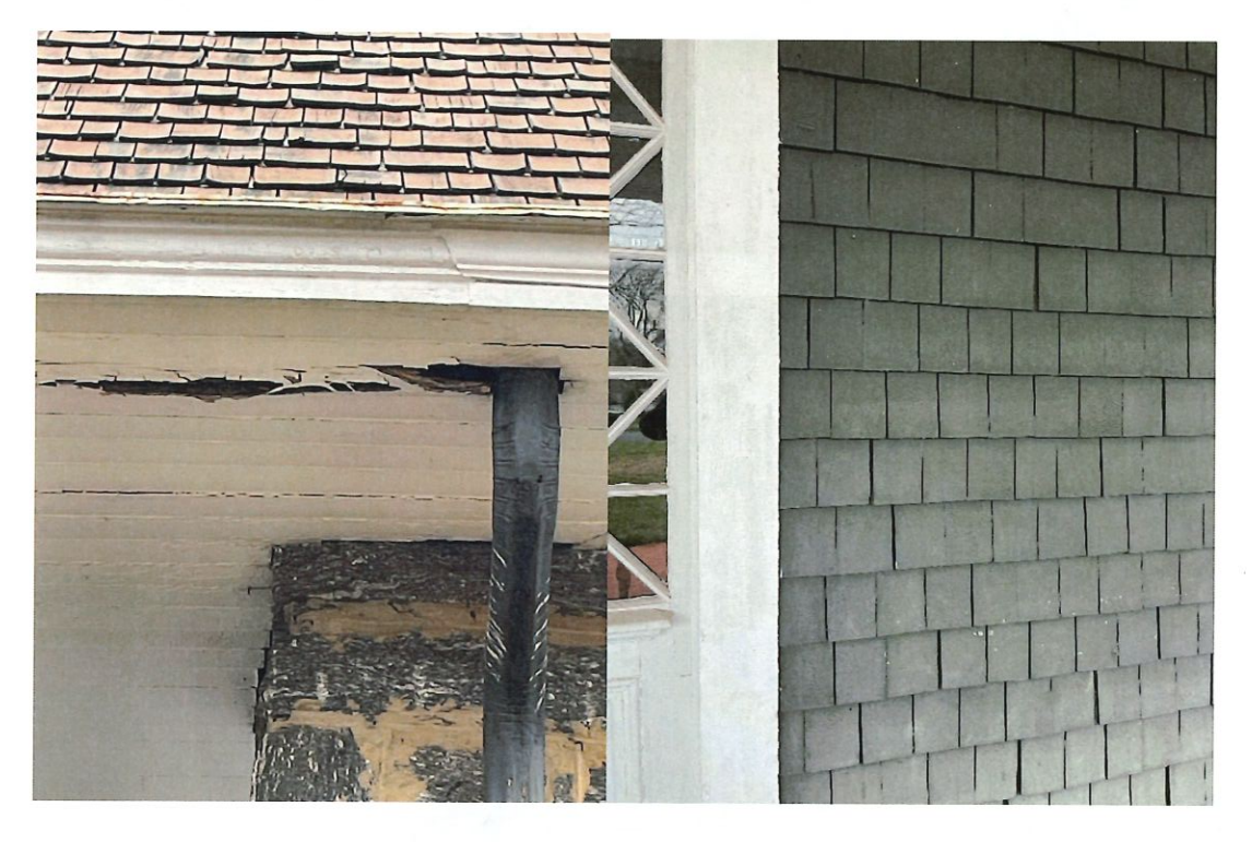
Figure 5: Applicant photo showing current porch photos.