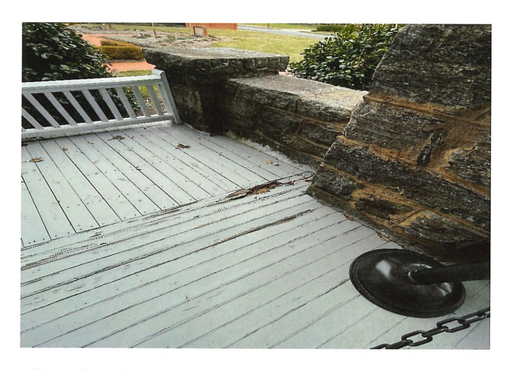
Figure 4: Applicant photo showing current porch conditions.