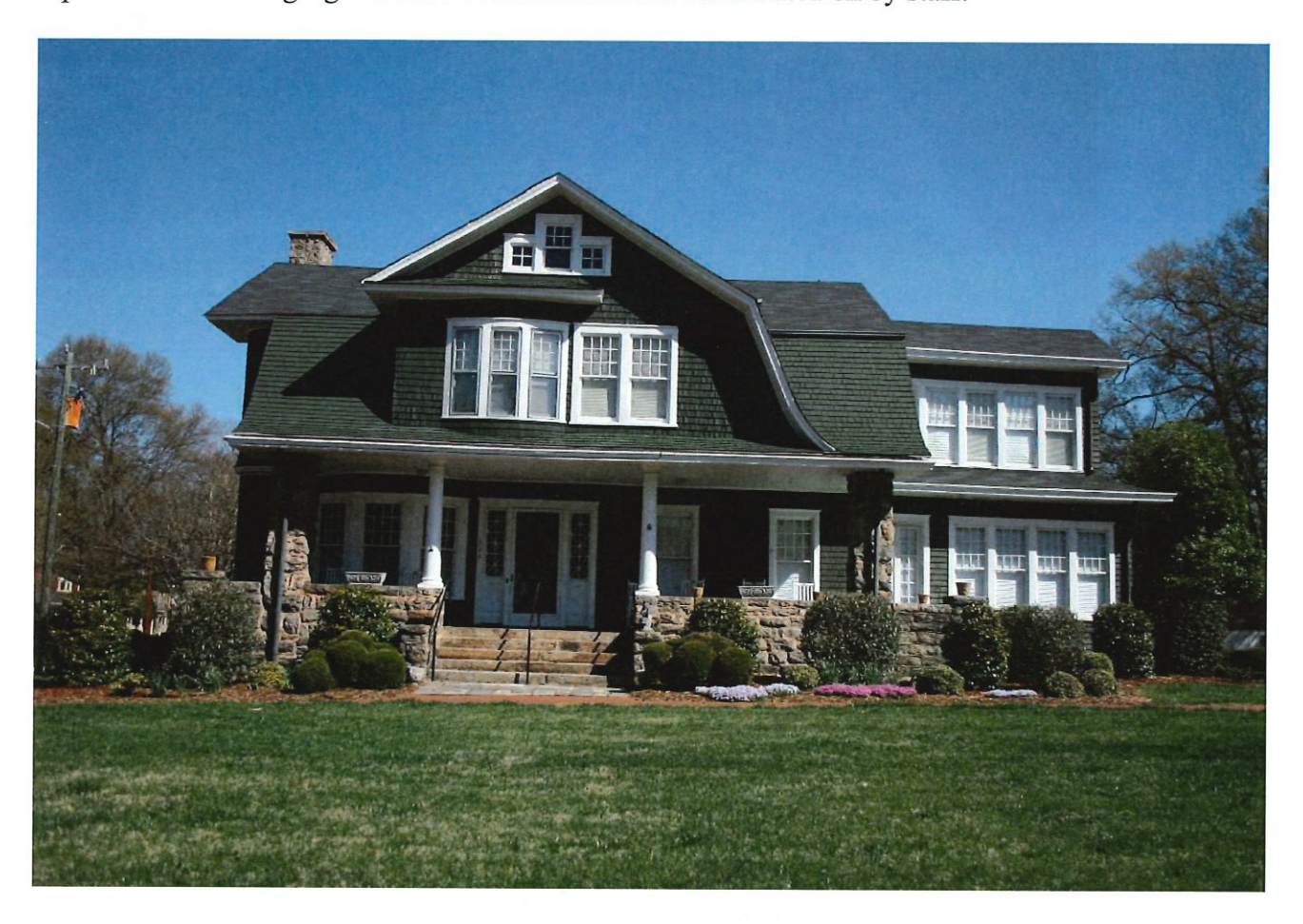
Figure 1: Photo showing the original design and color.

Visual Aids: A complete list of photos and plans provided by the applicant will accompany this report. The following figures have been selected and commented on by staff: