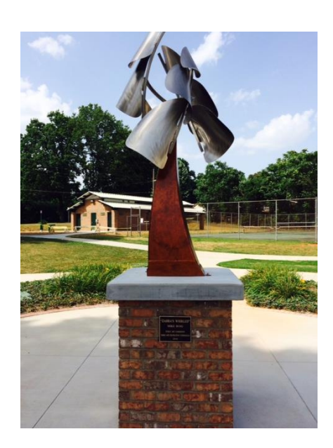
16. "Zahra's Whirled" by Mike Roig. The piece is a contemporary aluminum moving sculpture honoring the memory of Zahra Baker. It was dedicated in 2014 and is located at Kiwanis Park.