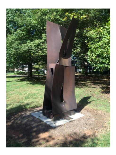
15. "Convergence" by Carl Billingsley is a steel sculpture. The piece is contemporary. It is located in Sally Fox Park and was dedicated in 2013