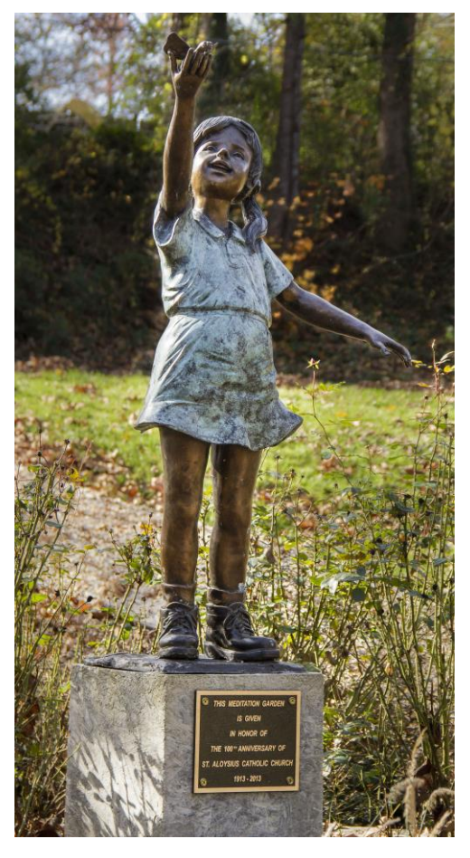
25. "Fly Away" by Randolph Rose. This bronze sculpture was donated in 2014 by Saint Aloysius Catholic Church commemorating its 100<sup>th</sup> Anniversary. The sculpture is located in McComb Park.