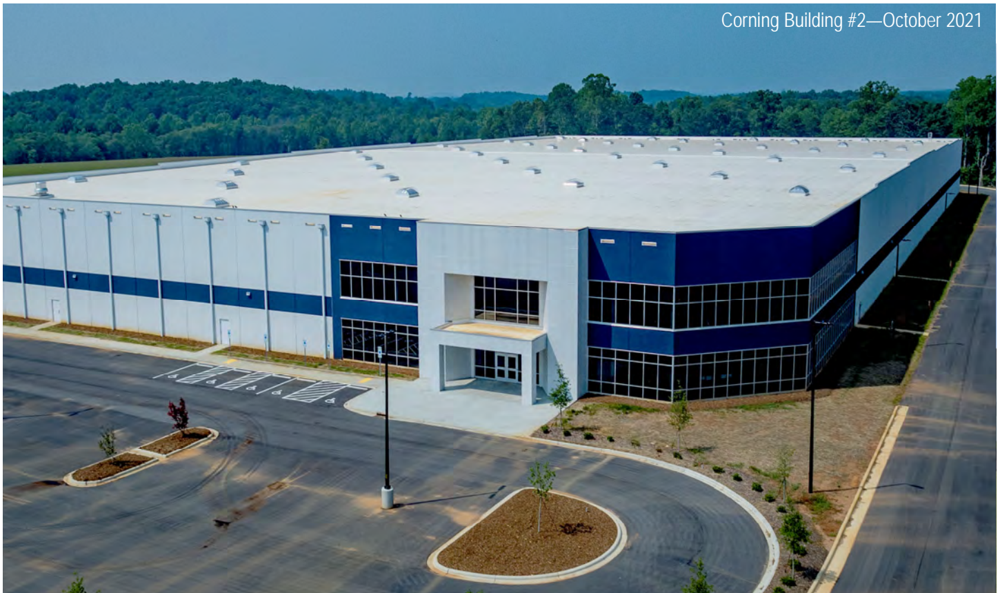
Corning Building #2—October 2021