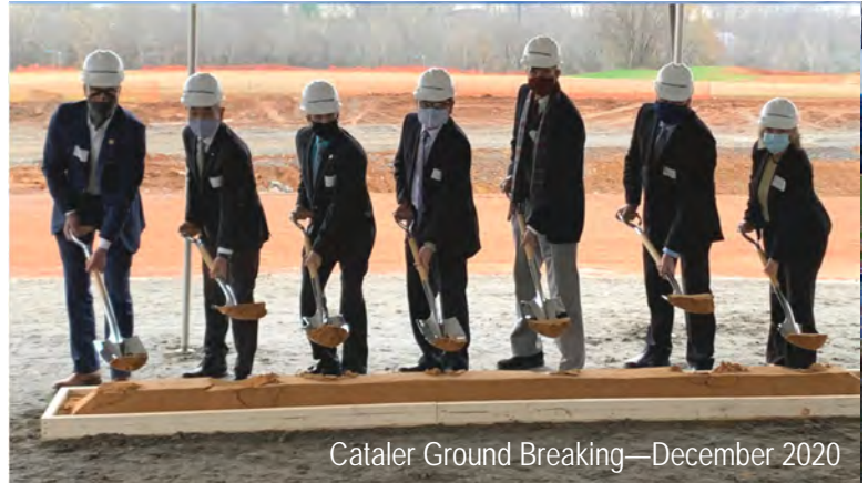
Cataler Ground Breaking—December 2020

We invite you to consider Trivium Corporate Center, Hickory's new 270-acre Class A business park. It is our intent to develop a business park compatible with the surrounding community and to promote a harmonious development for job creation for Catawba County citizens. Natural lands will be set aside within this park for scenic, natural walking trails.