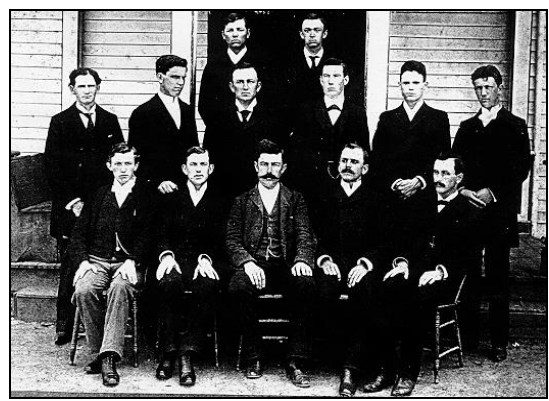
One of the many distinguished graduating classes of the Seminary.

The object of the instruction in the Academy was to provide a thorough English education, good business training and to prepare students for a regular Collegiate Course.