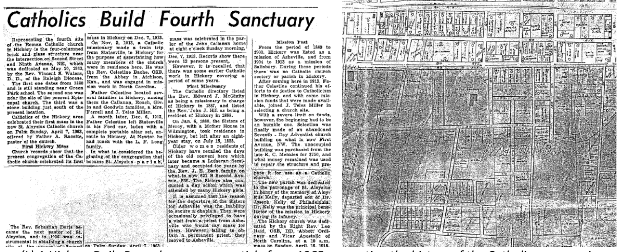
(L) A Hickory Daily Record newspaper article from 1965 recounting the history of the Catholic presence in Hickory. (R) A 1915 map showing "Ward 3," which covered Green Park.

Beyond the seminary, Green Park remained predominately residential in its early history. No significant commercial or industrial operations are known to have occurred beyond the outskirts of downtown and along the railroad. The origins of the name "Green Park" are not known. The first mapped reference of the name is in 1940s. The earliest available maps of the Green Park area are in 1915. Sandborn maps that were used for fire insurance purposes show the old Green Park School, built in 1916, listed as "West School" in 1931 and then changed to "Green Park Junior High School" in 1945. A historical overview of the Green Park School can be found in the Appendix.