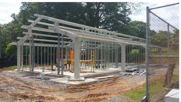
Photographs showing the new playground equipment (L) and upcoming community building (R).