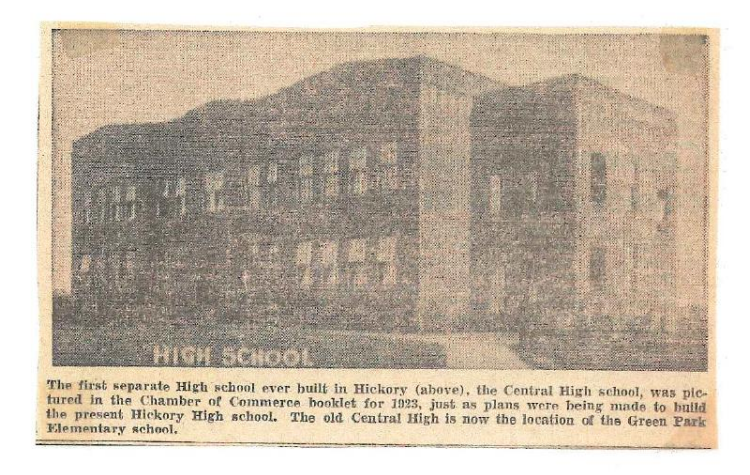
A photograph of the Green Park School used for a 1923 Chamber of Commerce booklet.

one of the three built in Hickory at the time. A teacherage for the housing of out-of-town, unmarried female teachers was added in 1923.